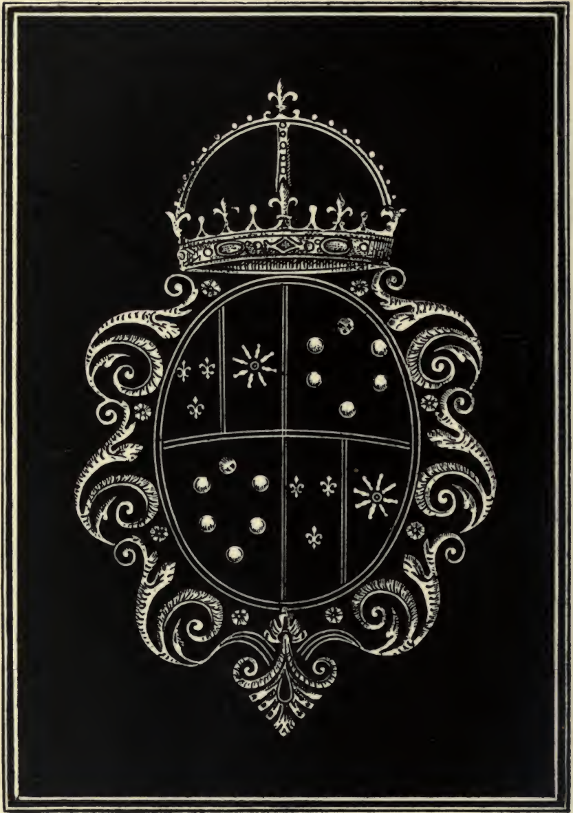
MARIE DE MEDICIS.